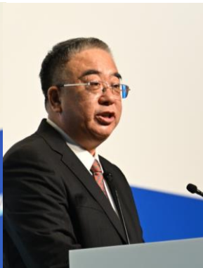
Mr FU Xuyin Vice Minister of the Ministry of Transport The People's Republic of China