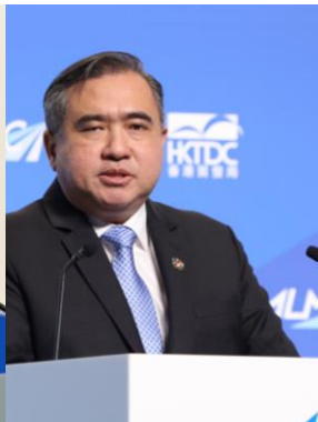
Mr Loke Siew Fook Minister of Transport Malaysia