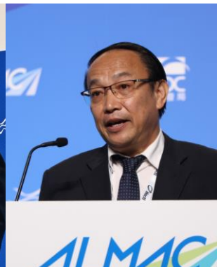
H.E. Saysongkham Manodham Vice Minister of Public Works and Transport Lao PDR